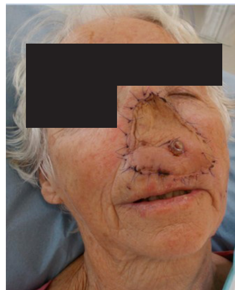
Figure 2: Postoperative result after total rhinectomy with radial forearm free flap.