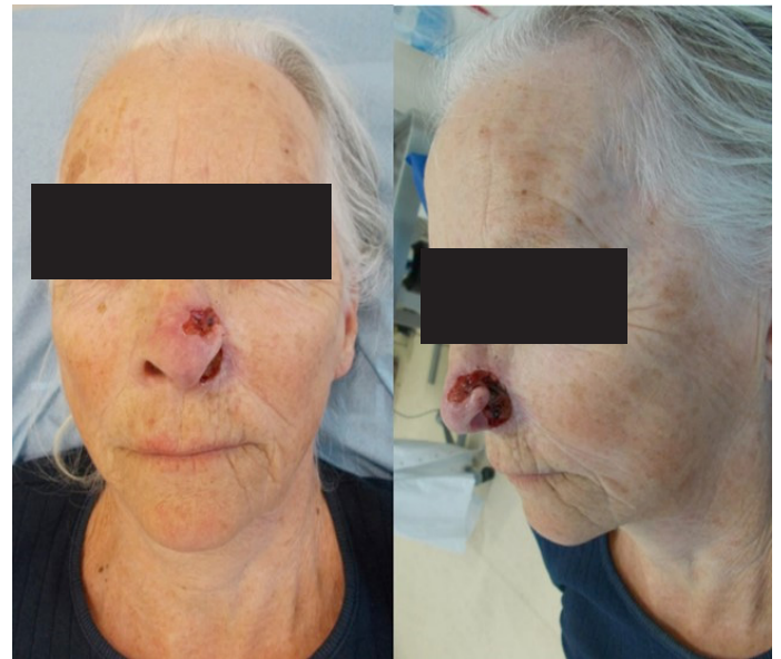
Figure 1: Preoperative T3N0M0 nodular BCC tumor on the nose showing loss of left ala nasi. This image is published with the patient's consent.

tissue as well as bone. HU for bones were set to 226 HU to 3071 HU and values for soft tissue were -700 to 225 HU. Since the right side of the nose was not affected cosmetically, this side was mirrored to create a visual template model for the whole nose by the 3D engineer. By utilizing the mirror image of the patient's healthy right side of the nose to cover the defect as seen in Figure 4, we were able to create an accurate model of how the healthy nose would have appeared in its entirety. This template model was used to shape and visualize the nose for the anaplastologist, to create the personalized prosthesis for the final look of the patient. A glued prosthesis was chosen for this patient and the result one year postoperative is shown in Figure 5. The patient was offered a minor revision of the left sided nasolabial flap but declined.